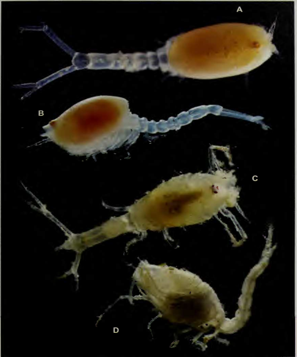
Figure 4.- A-B. Campylaspis glabra Sars, 1879: preadult female from Tenerife (A) and preadult male from Gran Canaria (B); C-D. Diastylis rugosa Sars, 1865 from Lanzarote.